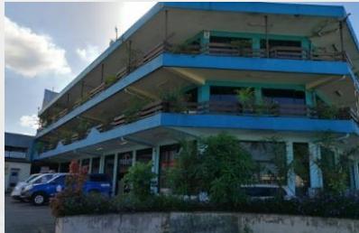
International Maritime University of Panama