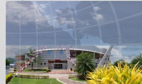
University of Trinidad & Tobago