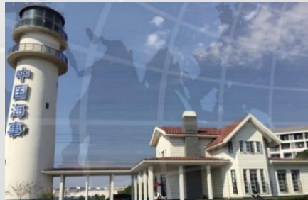
Shanghai Maritime university, China