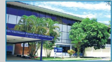
Pacific Community, Fiji